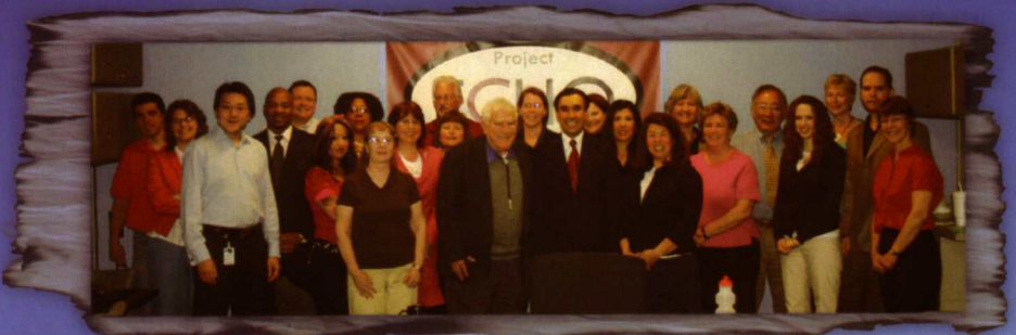
Project ECHO Team (Extension for Community Healthcare Outcomes)